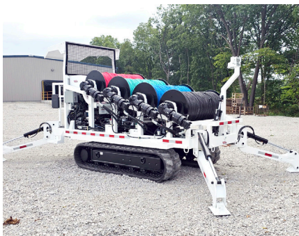
FULLY HYDRAULIC DIRECT DRIVE SYSTEM