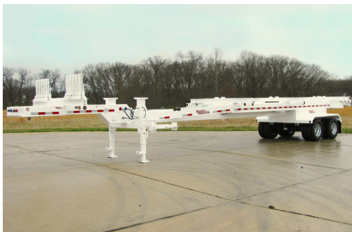
PTB - 202 WITH 5TH WHEEL UPGRADE